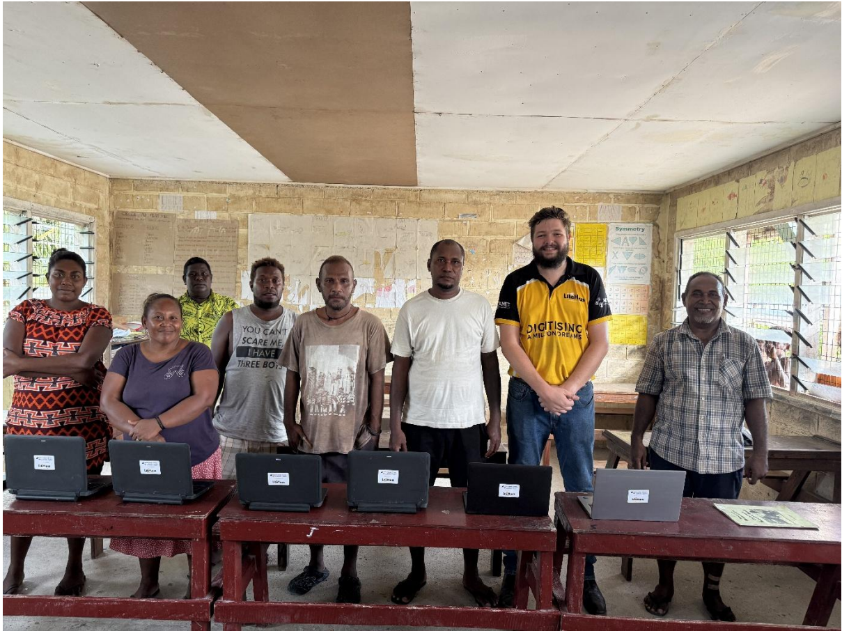
Caption 4: LiteHaus International Rep with teachers in Malaita Province.