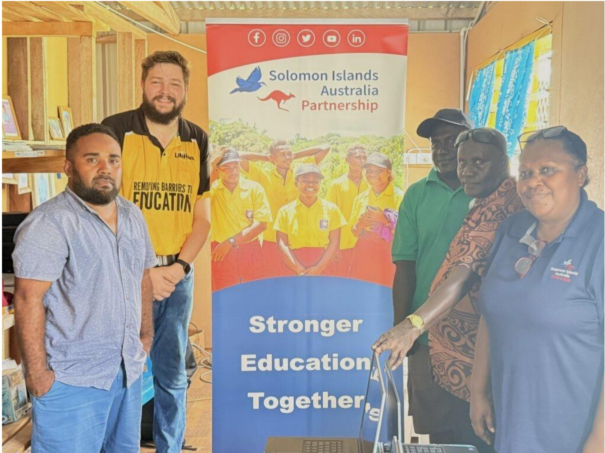
Caption 3: (Top left) LiteHaus International Rep, (Bottom right) Australian High Commission rep at Tehila Community High School.