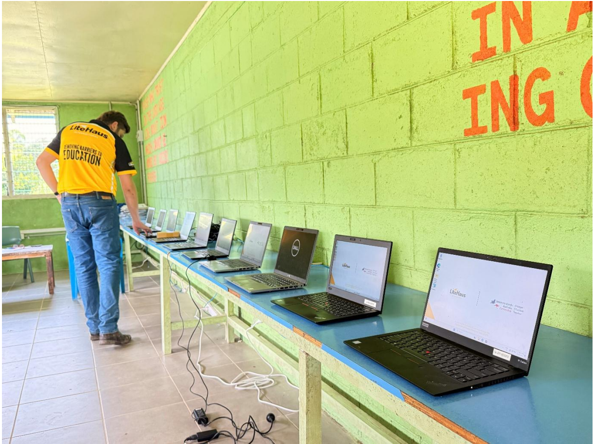
Caption 2: LiteHaus International Rep installing laptops at Kukundu Community High School.