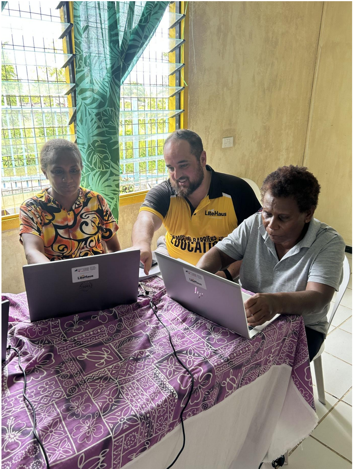
Caption 6: LiteHaus International Rep training teachers in Temotu.