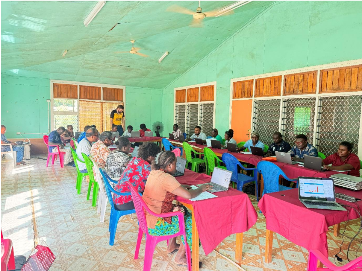
Caption 5: LiteHaus International's rep leading teachers during the 3 days teacher training.